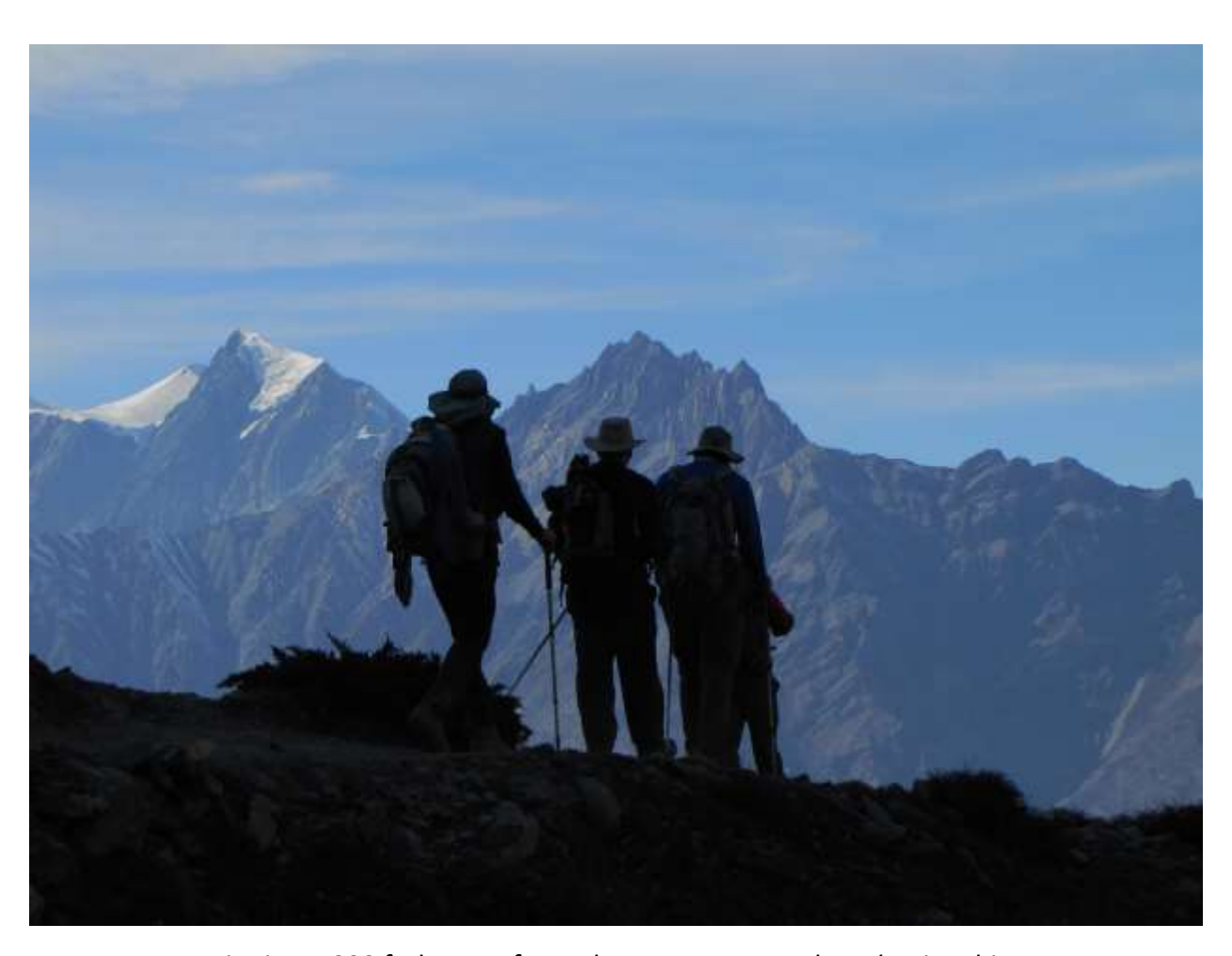
Beginning 5,000 ft descent from Thorung La Pass

The village of Tatopani is well known for its hot springs and we ended our hike there with sore feet and tired legs. We immediately headed to the hot springs to soak our exhausted bodies, down a few cold beers and think about our unforgettable trek in the Himalyas. Namaste!